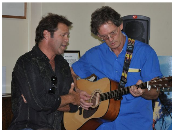
Champs and Troy Cassar-Daley performing an impromptu duet of a favourite Lefty Frizzell song at the People's Choice Awards